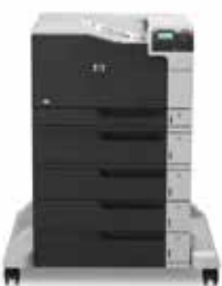
HP Color LaserJet Enterprise M750xh