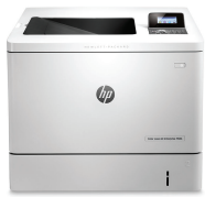
HP Color LaserJet Enterprise M553dn