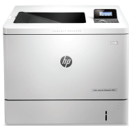
HP Color LaserJet Enterprise M553n

Speed and color are the perfect pair for your business. That's why this energy-efficient printer and Original HP Toner cartridges with JetIntelligence combine to produce vibrant, professional-quality documents right when employees need them.