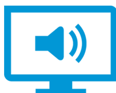
Power Bang & Olufsen Audio